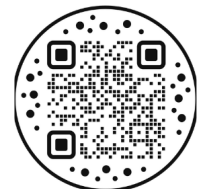
Altar Flower Form