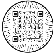
Prayer Request Form