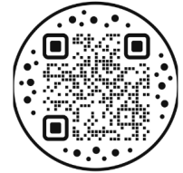
Altar Flower Form