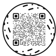
First Time Visitor Form

Our Worship Is Now Over, and Our Service Begins